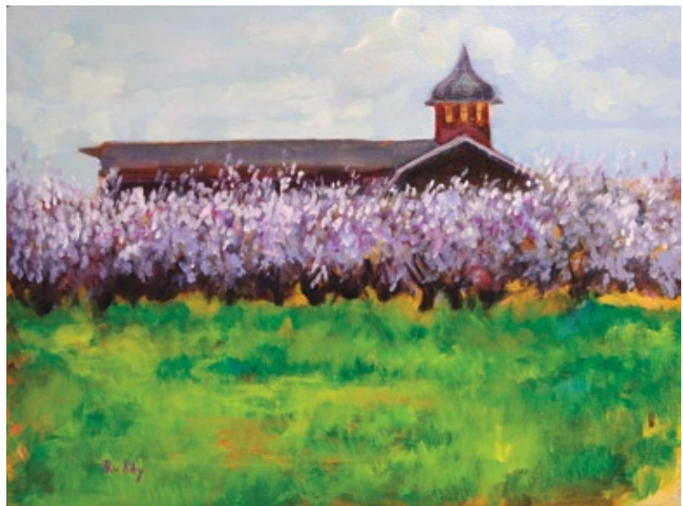
OBERTHIER BARN, OIL ON CANVAS, 18 X 24"

"My work is about color and feelings. The piece is not finished until it has a certain 'presence' about it," she explains. "My art is an effort to capture a moment and preserve the sweetness of it. It's not just about me making art; it is about honoring this place in the world where I live." ●