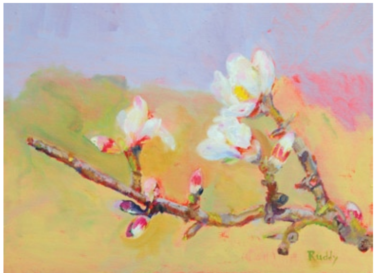
ALMOND BLOSSOMS, OIL ON CANVAS, 11 X 14"