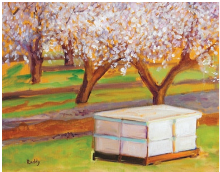
BEE BOXES, OIL ON CANVAS, 16 X 20"